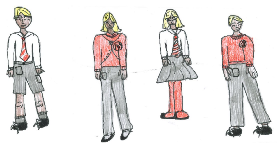
Please label all items with your child's name.

School does have some pre loved uniform available for any families who require it. Please contact the school office, to see what items we currently have available.